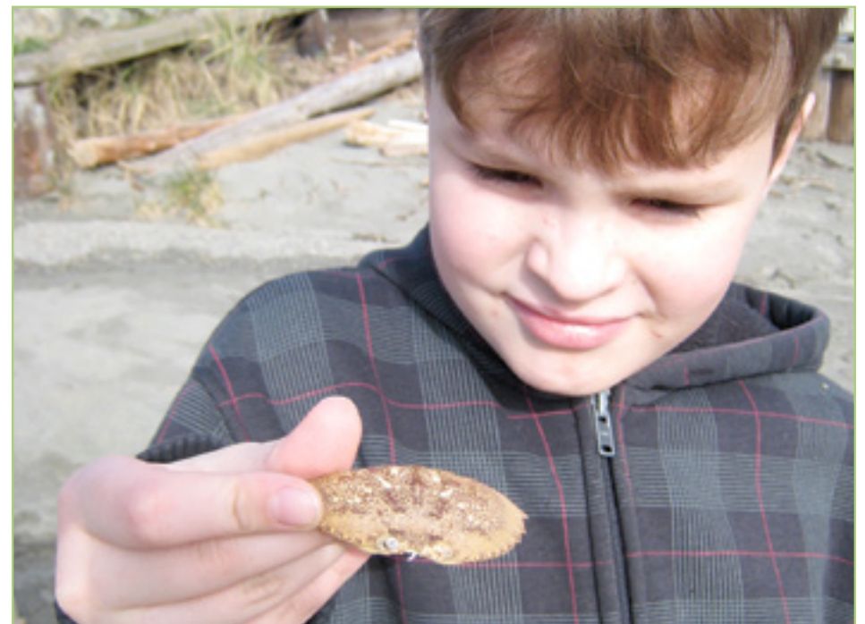
A third-grade student on a beach walk at Fort Worden.