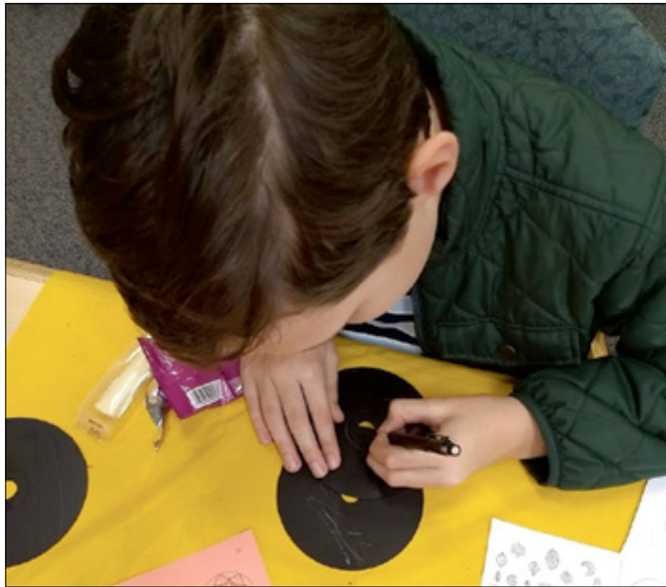
Blue Heron student creating upcycled CD mandala art at Lunch @ Your Library.

For more information visit pstschoos.org/levy