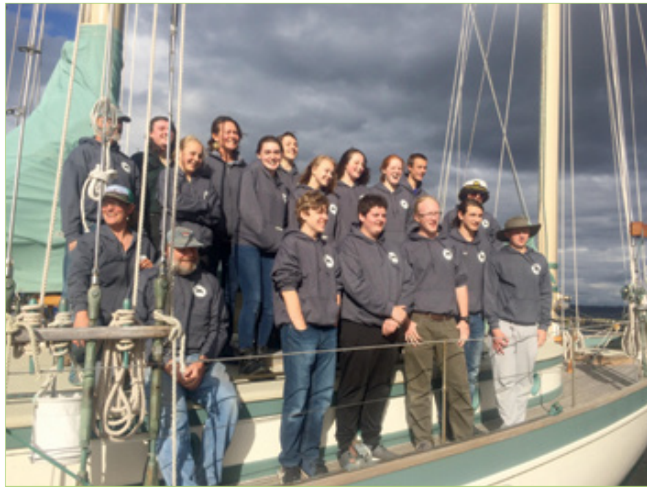
Schooner School students aboard the schooner Adventuress .