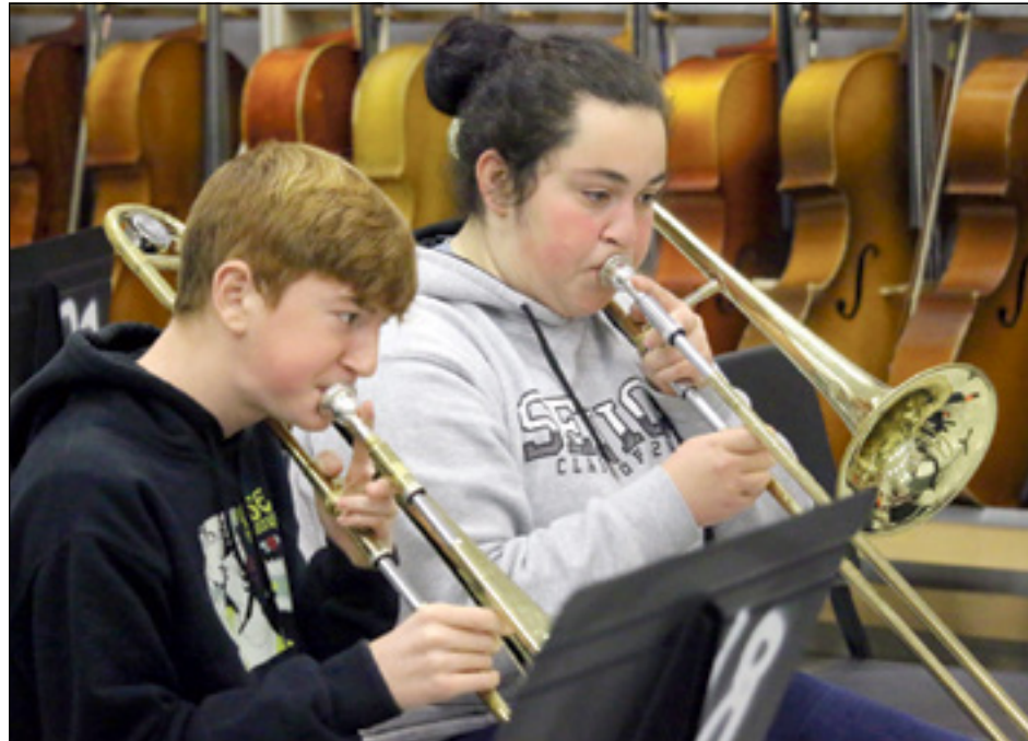
High School students practice for an upcoming concert.